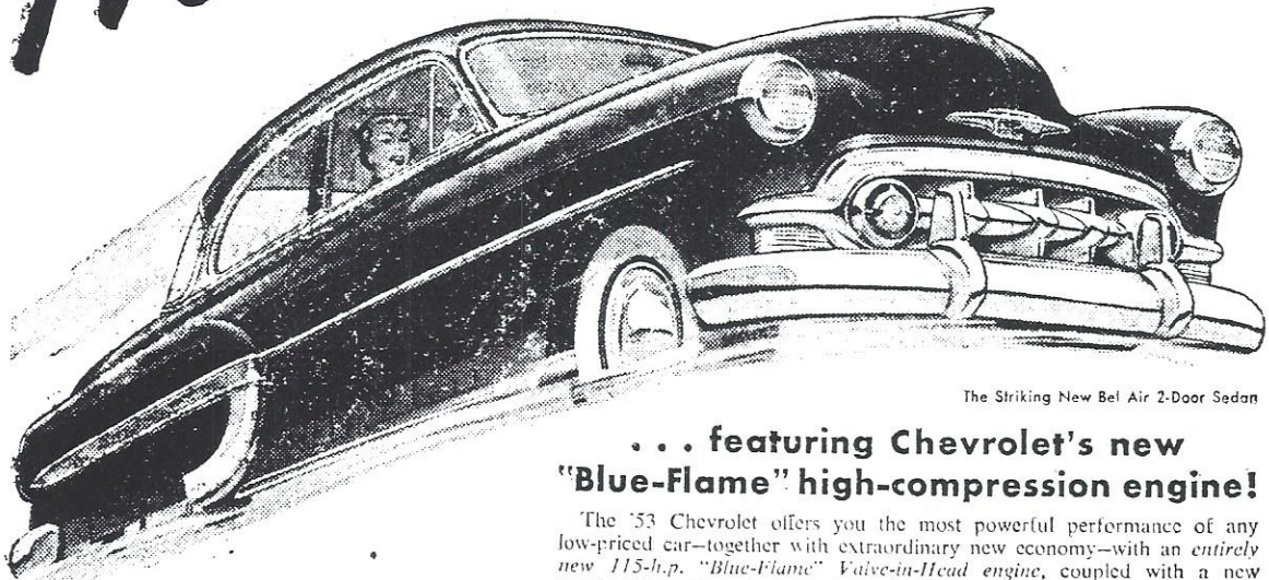
The Striking New Bel Air 2-Door Sedan

Most powerful car in the low-price field!