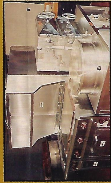
COME PREPARED TO BUY!