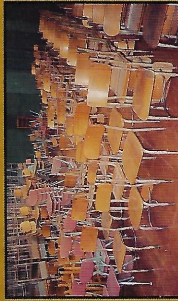
IDEAL FOR PRIVATE SCHOOLS AND CHURCHES!