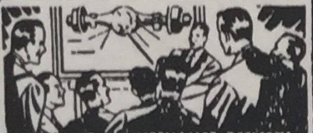
TRAINING MAINTENANCE OFFICERS

Here's the highest-quality motor car Chevrolet has ever offered to the motoring public . . . with fleet, modern, aerodynamic lines and Fisher Body beauty which create "the new style that will stay new" . . . with a powerful, thoroughly proved Valve-in-Head "Victory" Engine, built of quality materials and designed to lead in combined performance and economy . . . with all the fine comfort, convenience and safety features which have made Chevrolet the nation's leading motor car for ten of the last eleven years.