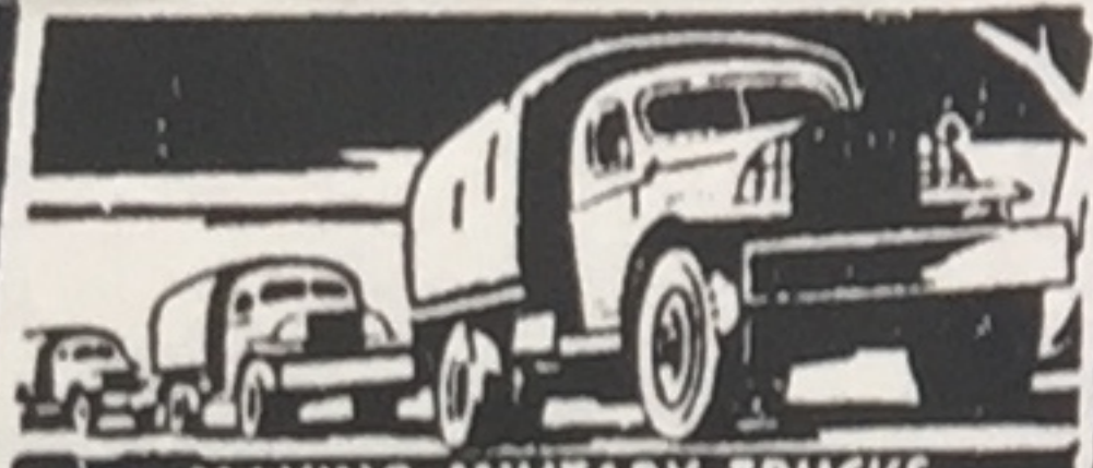
MAKING MILITARY TRUCKS