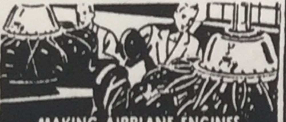
MAKING AIRPLANE ENGINES