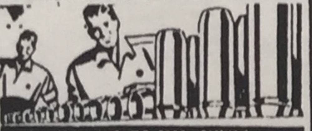
MAKING 75-MM. SHELLS